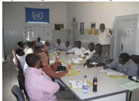
Photo: "NFI EP&R Capacity Building in Damazine, Blue Nile" – Adam Bernstein, UNJLC

Moving forward, UNJLC is working with the Flood Task Force (FTF) in Khartoum to ensure a smooth humanitarian response to possible floods in 2008. The FTF will act as the main coordination forum during the floods and UNJLC is supporting the FTF in its efforts to improve coordination and information sharing with the Government of Sudan (GoS) and Ministry of Civil Defense.